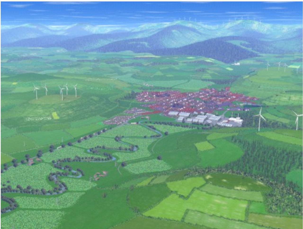
Fig.12 Computer-generated future landscape with insensitive development of large turbines, forest-residue biomass power stations, short-rotation coppice and commercial forestry on the hills.

In this respect, Ethos has pioneered the integration of renewable energy, agricultural and forestry strategies as represented by computer graphics – and essentially, to act as a tool for decision-makers, rather than in the advocacy of any particular path (4). The cross-border cooperation of landscape design professionals could lay the foundation for specific regional studies, and this work could be extended into schools and Universities within the region as a way of cultivating responsibility for landscape decisions. For example, in Fig.12 below, rapid insensitive development that exports energy from the land is contrasted with (in Fig,13) slower, more sustainable development that takes account of scale, community, and the feeling of nature, whilst offering local-based solutions to the energy and climate problems.