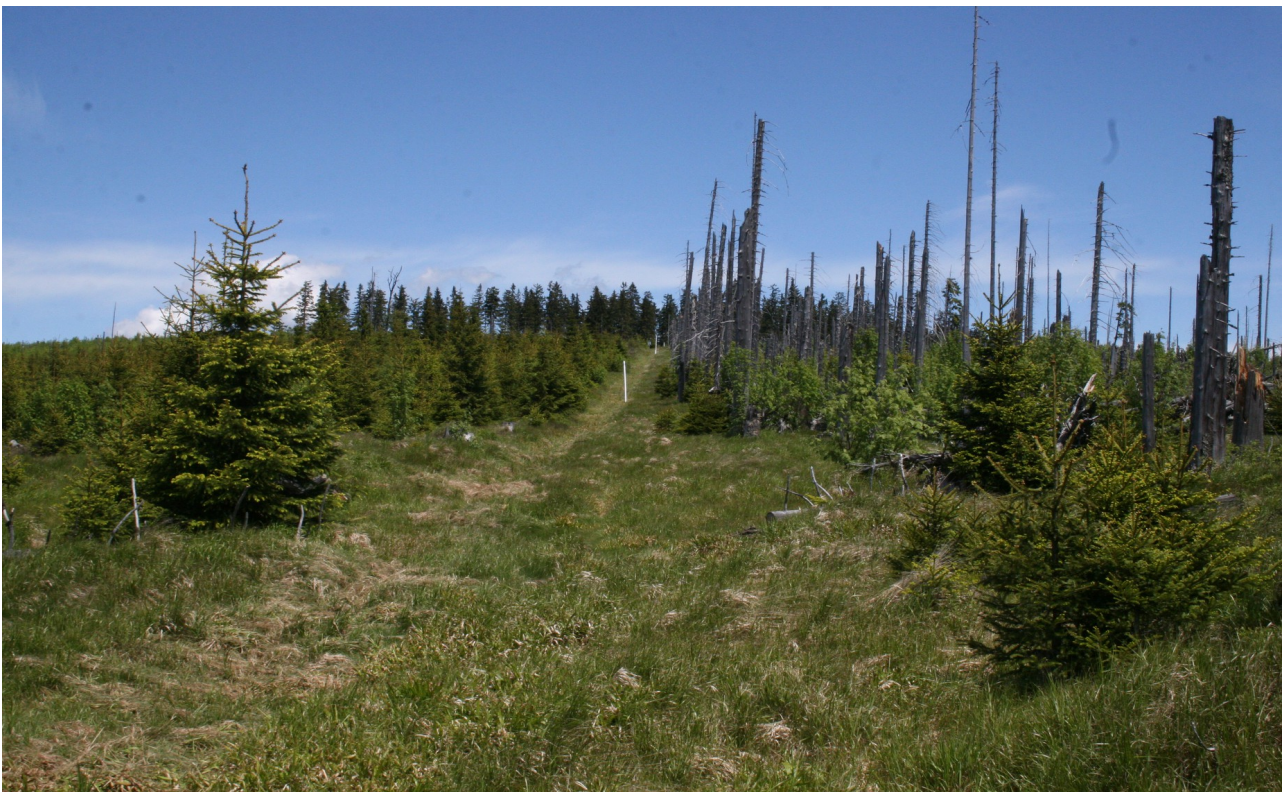
Fig. 4 On the left, Czech Republic; on the right, Germany: showing the difference in approach to dead trees