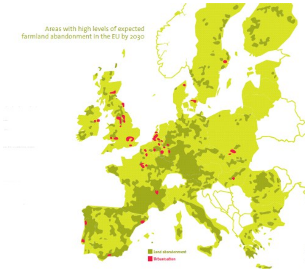
Fig. 1 Areas with high levels of expected farmland abandonment according to research for Rewilding Europe, 2012.

Whether the high levels of 'abandoned' land do manifest depends very much upon definitions of abandonment and the range of other pressures for development and land-use. However, there are large numbers of people, both young and old, who would gladly return to the land and community, and live more closely to nature, without the need to engage in those traditional practices, such as extensive grazing, that have limited the regeneration of natural forest cover and the recovery of wildlife. Many of these people would be economically viable in crafts, arts and home-based work, if property costs and required capital investments were not a barrier. The question arises as to how a reverse migration might be enabled, but also, what barriers might also exist to integration of young people into older and perhaps still traditional communities. Much experience must already exist throughout Europe – and we would like to see this material collected and evaluated.