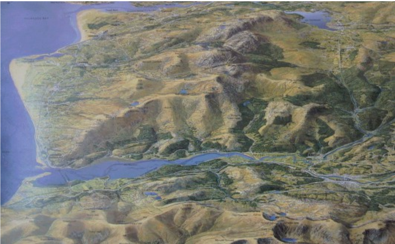
Fig. 10 The Rhinog Hills in Snowdonia National Park, North Wales.

The loss of community is a key social issue, made more prescient by the need to preserve the Welsh language and its connection to the landscape. Despite its apparent cultural role, sheep farming is a relatively modern development, as are extensive conifer plantations. Both have become uneconomic and an ageing farming community, propped up by government subsidy, is not being replaced.