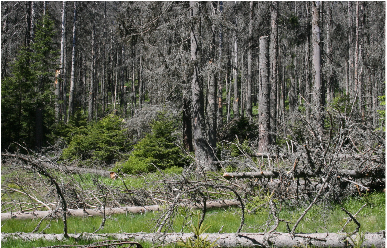
Fig. 5 Dead stands when left to fall naturally, showing tangled undergrowth, preventing grazing by deer and fostering rapid regeneration.