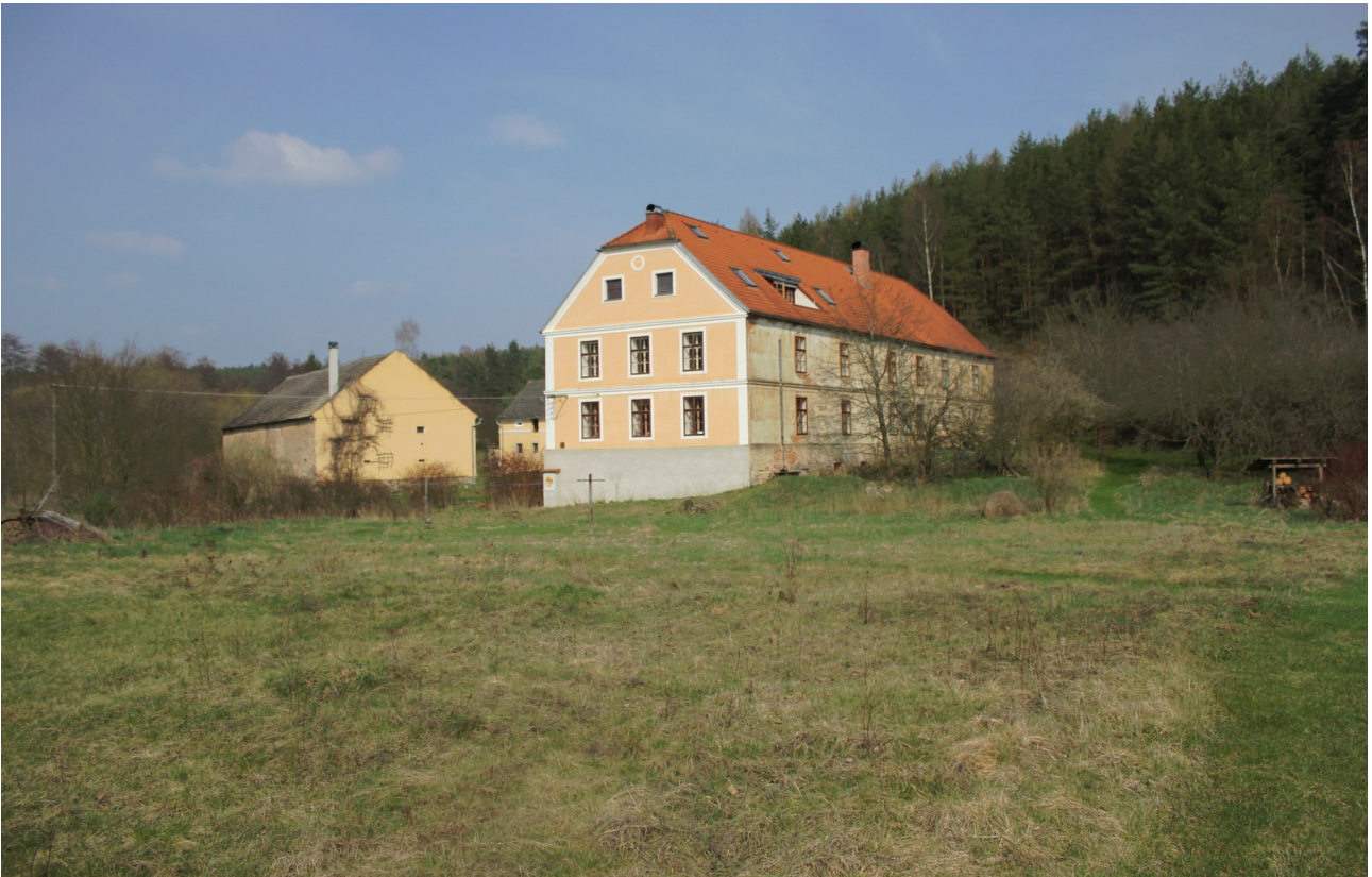
Fig.7 The Water Mill at Tunechody, near Stribro, Czech Republic.

The Old Mill at Tunechody, near Stribro, was renovated 15 years ago by Dutch entrepreneurs who created a spiritual centre for yoga, dance and shamanic courses. It is now for sale. It was originally built by a German family in 1896 as the first electric-turbine powered flour-mill. The family were forced to evacuate after the Second World War and the confiscated property was eventually sold on, first to a Czech family and then following the liberation from Communist ideology and control, it was bought for extensive renovation by the Dutch couple.