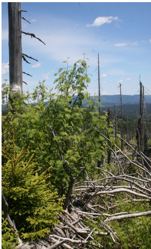
Fig 6 Advanced regeneration in the German non-intervention zone.