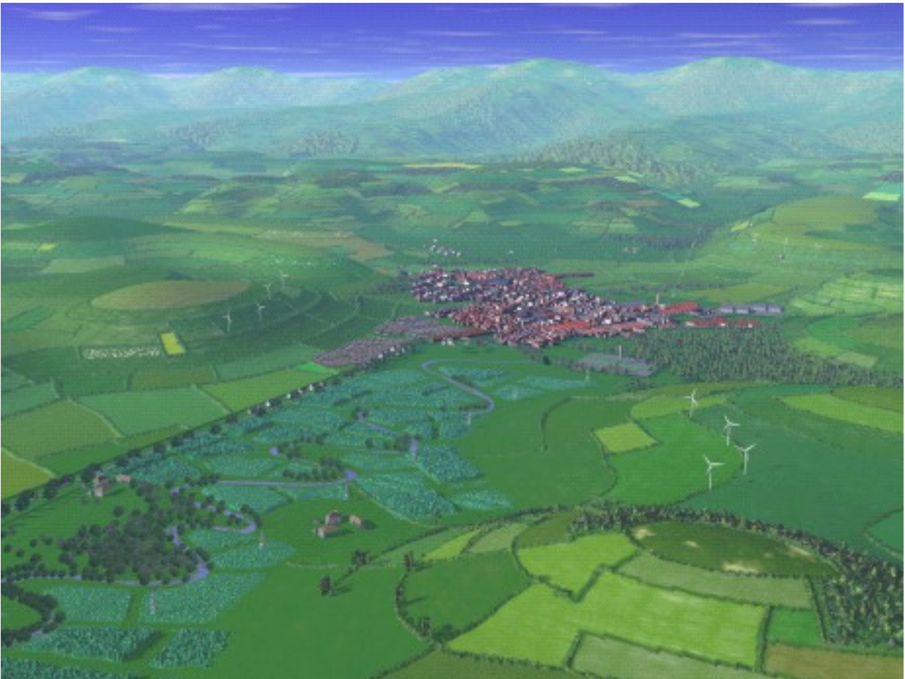
Fig. 13 Sensitive and sustainable development with smaller scale local resources, rewilding on the hills (native forest regeneration acting as carbon sinks), with a major focus upon biofuels and solar power for local use.

We would like to see this approach taken into rural communities throughout Europe and adapted to local circumstance. Computer graphics can be made site-specific and involve local educational institutions in the creation of a knowledge base to inform local decision making.