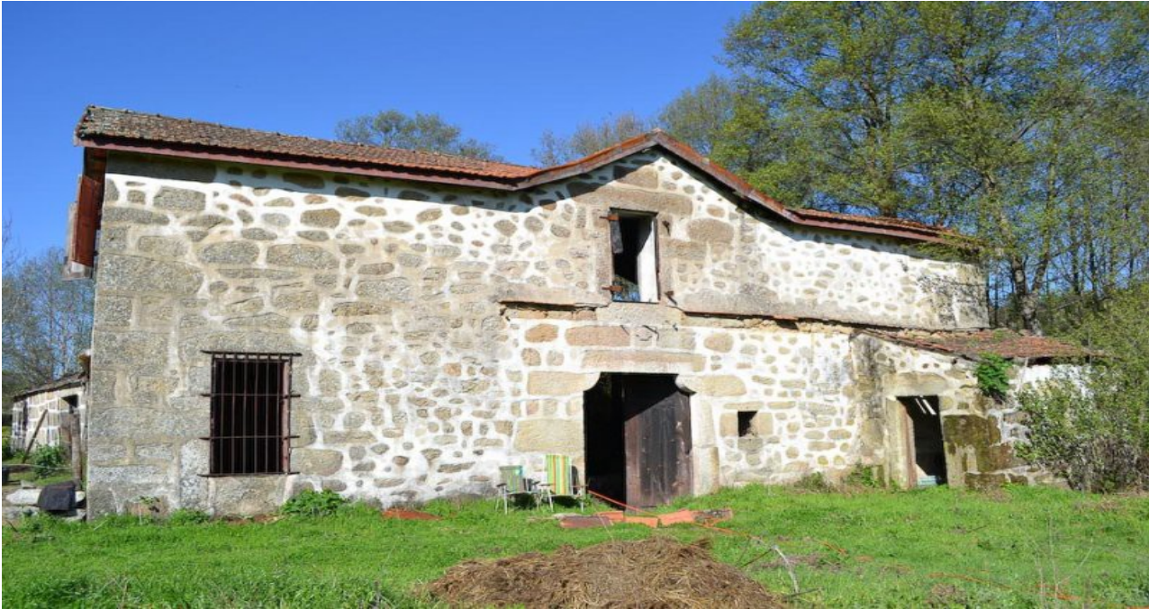
Fig. 9 Property for purchase and renovation within the Vale das Lobas Project.

How far sustainable community can be recreated is a question of further research – and there are many such eco-communities with a variety of ownership models that would repay analysis such that lessons-learned best practices can be derived.