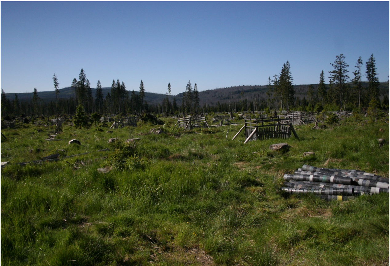
Fig.3 Once cut logs are removed, grazing deer prevent regeneration. Wooden cages protect a planting programme using nursery grown broad-leaves such as Mountain Ash.