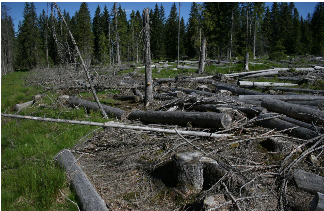
Fig. 2 Dead timber is cut for removal in the Czech National Park

My Czech partner, Monika Michaelova, who is active teaching modern women the old ways of healing with medicinal plants, bid everyone to close their eyes and feel the difference also! It was tangible – a vibrant almost radiant energy of the life-force itself, where only a few hundred metres away in the Czech landscape, there was silence and the feel of a deathly stillness.