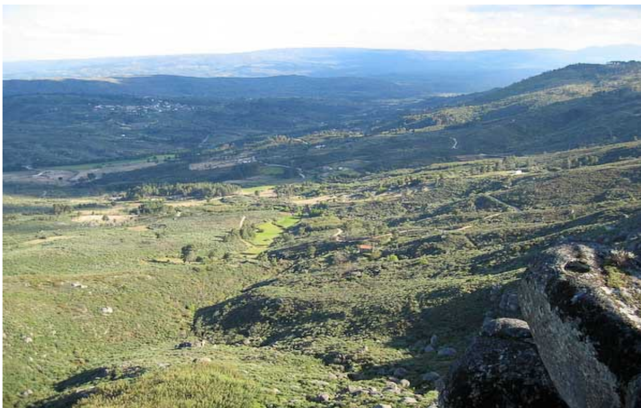
Fig. 8 Vale das Lobas: Upland area with sparse forest land and abandoned meadows.

This project (which we have not yet visited) in the borderlands of Portugal with Spain, was begun by a small group of young British people connected to the International Rainbow festivals. They have bought land, renovated properties and are now seeking to create an international community centred around permaculture, shamanic teachings and experience of wild nature. A number of ruins on the land have been put up for private sale.